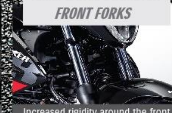
41mm LARGE DIAMETER FRONT FORKS

Increased rigidity around the front section to rightly suit the separate handle set-up at front.