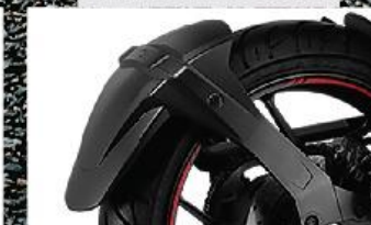
REAR TYRE HUGGER

To complement the stylish design of the premium bike.