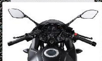
CLIP-ON HANDLE BARS

For a sporty riding position. FOR GIXXER SF