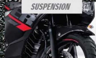
STIFFER FRONT SUSPENSION

Increased rigidity around the front section to rightly suit the separate handle set-up at front.