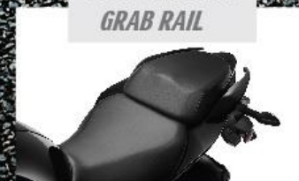
SPLIT SEAT AND GRAB RAIL

Sportier appearance to ensure foot reach by reshaping contact area of the seat with the inner thigh.