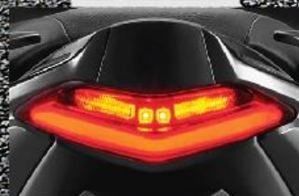
LED TAIL LAMP

Compact design with highly illuminated LED lights.