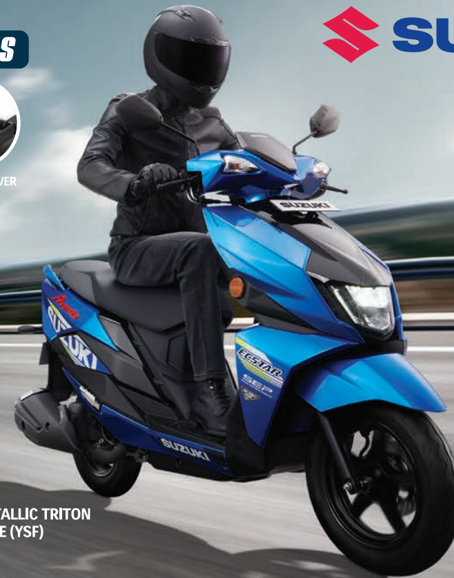
METALLIC TRITON BLUE (YSF)