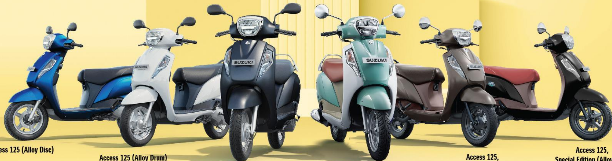
Access 125 (Alloy Disc)